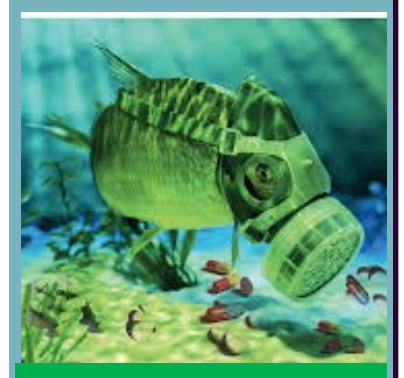
NO DRUGS DOWN THE DRAIN